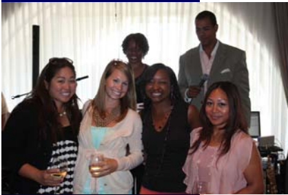
Team HEAL Certified Athletic Trainers

For more information on how to be involved in a future fundraiser, contact the Team HEAL office: 310-645-8347