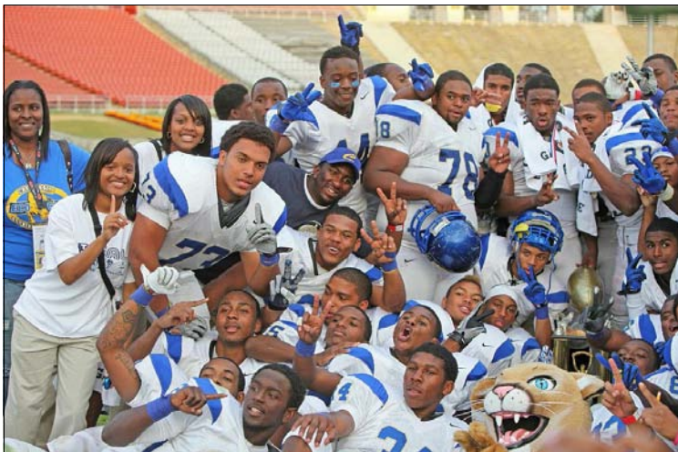
Los Angeles City Section Champions Crenshaw H.S. Football Team